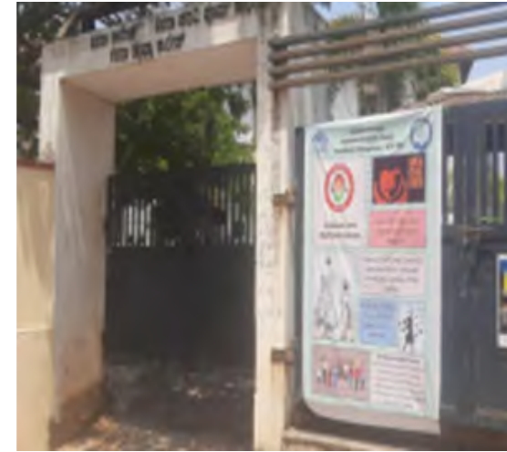
Canara College, Karnataka