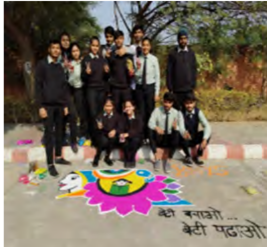
Jagannath University, Rajasthan