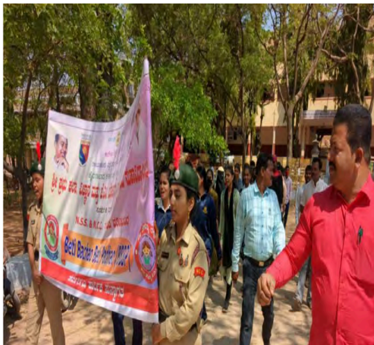
Shri Prabhu Arts Science, Karnataka