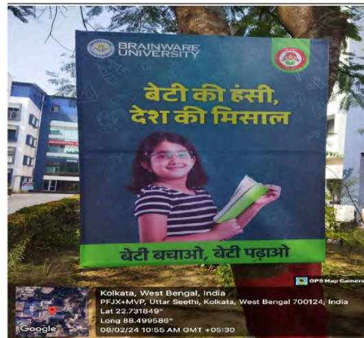
Brainware University, West Bengal