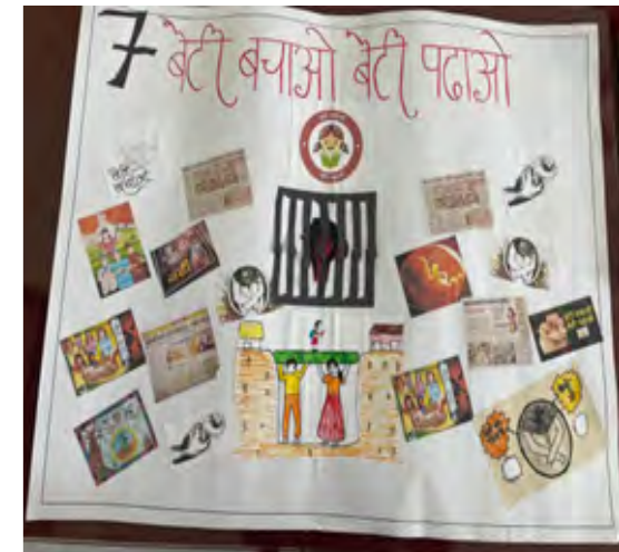
St Philomena College, Puttur, Karnataka