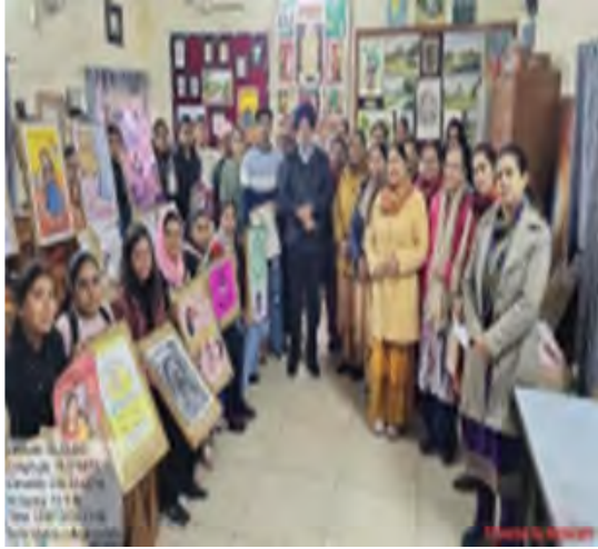
Khalsa College, Patiala