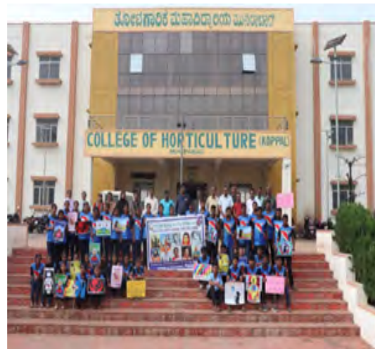
College of Horticulture, Munirabad, Karnataka