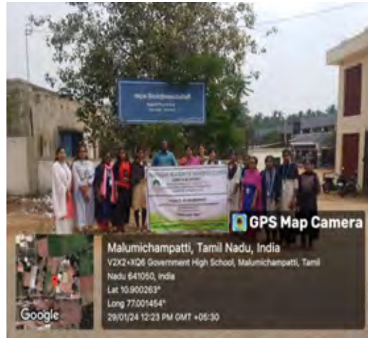
Karpagam Academy of Higher Education