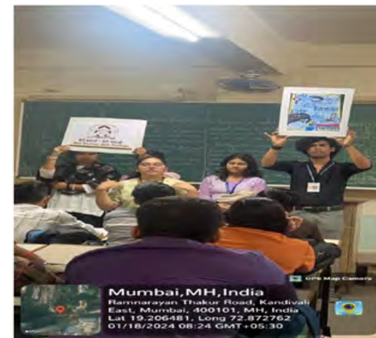
Thakur College of Science Commerce, Maharashtra