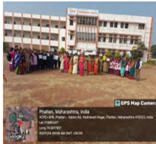
Mudhoji College, Phaltan